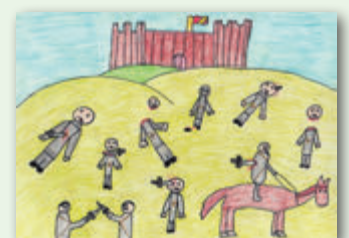
Chaos at the Castle' illustrated by Alliya Trueblood

Buy yours from the Museum or ESCA and enjoy a good read.