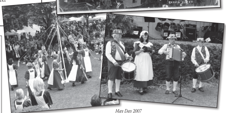
May Day 2007

A warm welcome awaits you at Eatons Evangelical Church meeting on Sundays at Crosshall School, Gt. North Road Family Service - 10.30am Evening events as advertised 'Energise' for 11-16's - monthly Further information www.eatons-church.org.uk