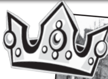
Eaton Socon May Day Postcards

Sat 3rd May and Mon 5th May St Mary's Church, Eaton Socon 10am - 4pm