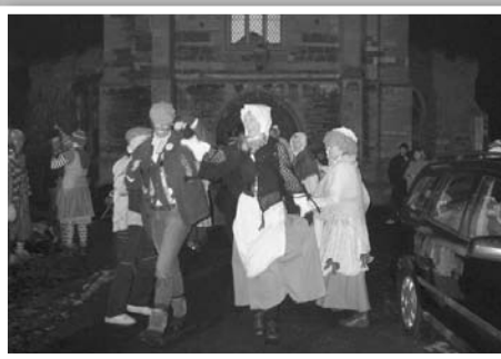
Old Hunts Molly dancers