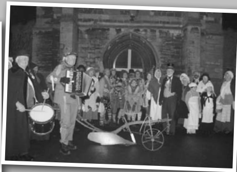
The assembled company

Plough Monday pictures from 2010