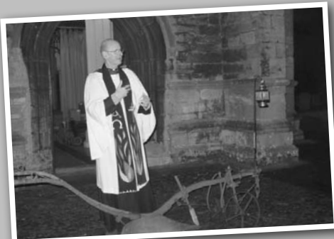
Blessing the Plough

This event was previously held in Fenstanton and was moved to Eaton Socon last year.