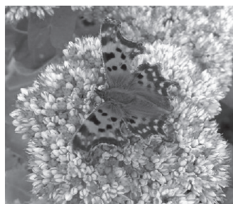
Comma butterfly on Sedum flowers

Most insects are not feeding during December and January. It is the odd balmy day in February which can tempt them out, then they need food as quickly as possible. The best types of flowers to grow are those with easy to access nectar and pollen sources. Dense, double flowers may look lovely but are generally