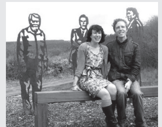
Portrait bench in Afan Valley, Wales