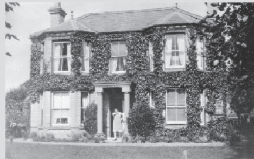
Who lived in this lovely house in 1911